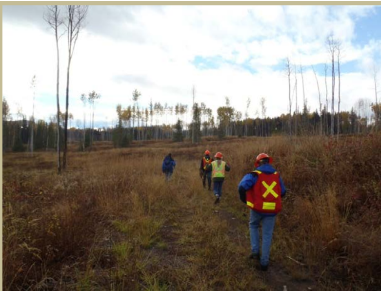
Figure 5. A deactivated road in the cutblock (October 2012). Note the retained deciduous trees and wildlife tree patches in the background.

Openings, somewhat similar to those created by logging, would likely have been created naturally anyway, as MPB killed trees fell down over time. However, clearcutting created a large opening immediately, which likely advanced and intensified effects that may have otherwise taken several more years to be realized.