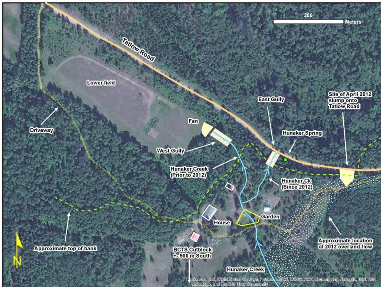
Figure 2. Site details.

erosion evident and high spring peak flows only started eroding the gully in 2009, leading to formation of a fresh alluvial fan in the lower field.