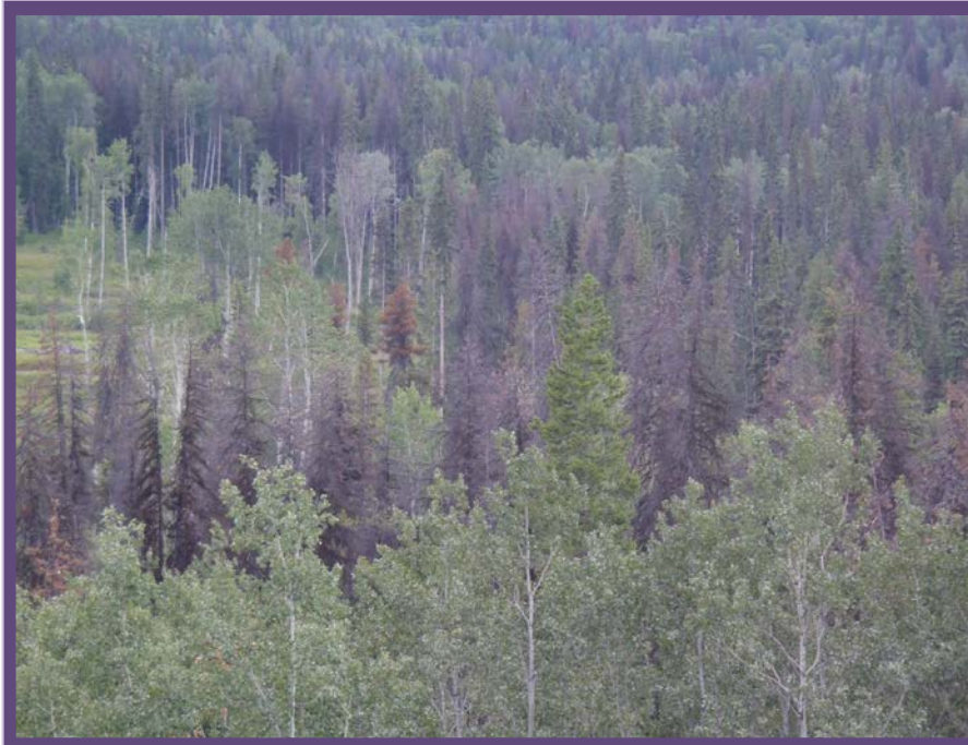
Figure 4. MPB affected forest near the BCTS cutblock, August 2012.

Deciduous stands, which comprise approximately 30 percent of the Hunaker Watershed area, typically have more rapid snow accumulation and melt than conifer stands, due to annual leaf fall resulting in an open winter canopy. As MPB affected lodgepole pine trees die and become defoliated, canopy closure is also reduced, resulting in more rapid snow accumulation and snowmelt. iv