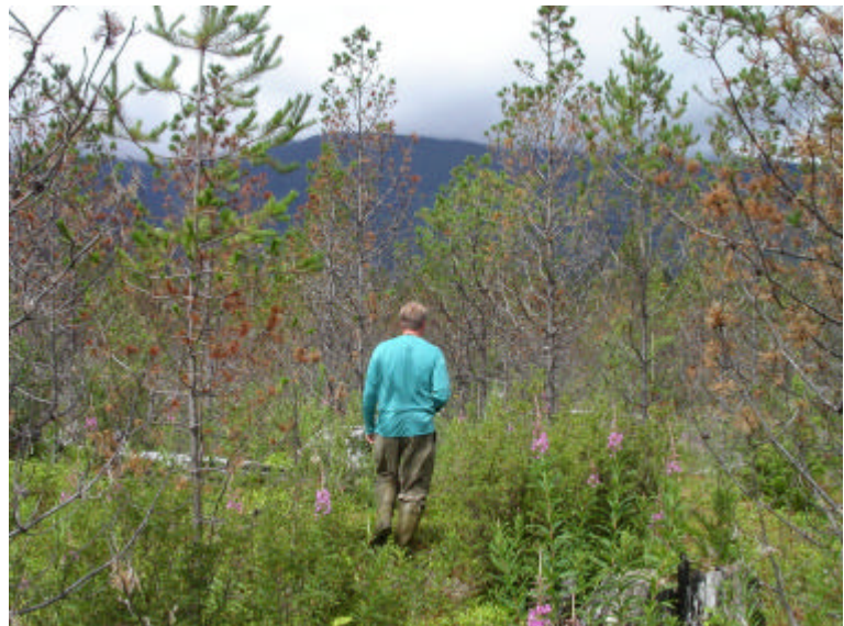
Dothistroma infected lodgepole pine stand

Where environmental conditions favour infection (cool, moist summers), this blight can spread rapidly and cause significant damage. Trees can be defoliated within one year and mortality is common with repeated attacks, especially in young stands.