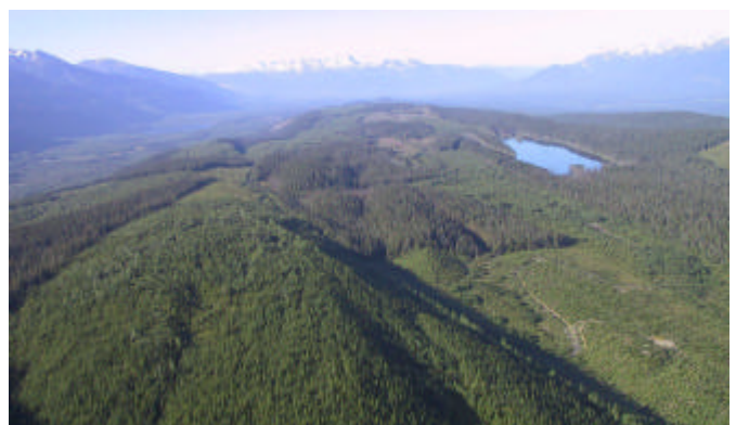
Overview of Nisga'a Lands