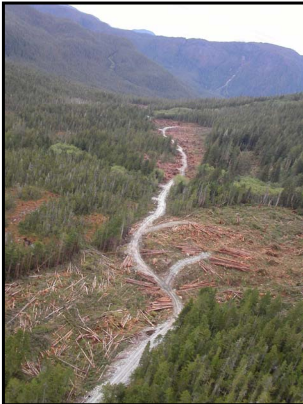
One of four SWC cutblocks audited.

On July 7, 2000, SWC entered into a management agreement with International Forest Products Limited (Interfor). Under the terms of the agreement, Interfor is responsible for all activities related to the planning, harvesting, and regeneration of cutblocks under the forest licence.