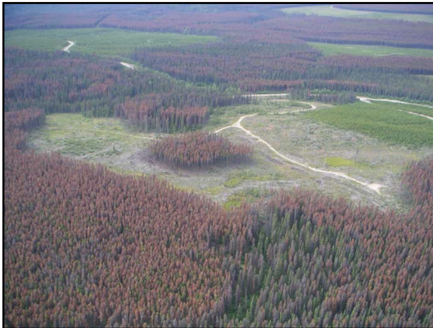
Mature pine forests heavily infested with mountain pine beetle.

has long cold winters and warm dry summers. Lodgepole pine stands are the most common timber type, and the area has been under heavy MPB attack for several years. MPB is by far the most significant forest health concern, and most of the harvesting during the audit period was to salvage MPB-decimated stands. The MPB management strategy for the majority of the audit area is salvage, rather than control.