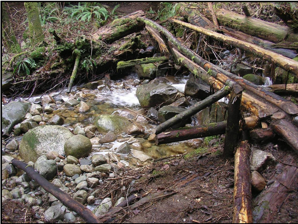
Figure 3. "Bridge" built by all-terrain motorcycle users to avoid stream damage.

In addition to funding, dealing with the issues requires an organization to coordinate the implementation. Until 2002, the MOFR was taking on that task. Thereafter, implementation was abandoned by the MOFR, but has not yet been taken up by another arm of government.