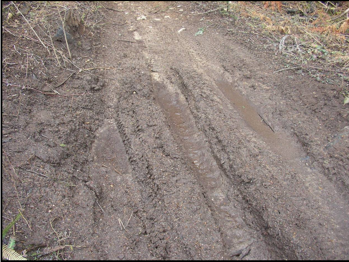
Figure 2. Trail rutting by all-terrain motorcycles.

The strategy recommended that the MOFR implement the proposed actions. However, funding and government staffing were reduced, so the actions were not implemented. In June 2005, the Ministry of Tourism, Sport and the Arts (MOTSA) was created and made responsible for tourism and resort development. The new ministry's mandate included recreation, but the recreation management function was adopted slowly, in stages. In January 2006, MOTSA took over responsibility for some recreation in provincial forests (at sites and trails) from MOFR. However, it did not acquire authority to generally control recreation on Crown land until mid-2006, which required delegation from the Minister of Forests and Range. As a result, neither agency has taken on the task of implementing the Blue Mountain recreation strategy; therefore the strategy has remained suspended and conflicts among recreational users continue to increase.