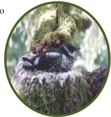
Marbled murrelet nest.

Marbled murrelets have wide-ranging and secretive nesting habits, so nest locations cannot be used to identify utilized habitat. Instead, habitat is inferred from forest attributes. There are a number of ways to identify probable nesting habitat, including visually inspecting habitat from a helicopter for the mossy platforms that murrelets prefer as their nesting sites. In the area of the forest stewardship plan examined in this report, the licensee identified all habitat by such visual inspection.