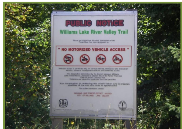
Notice restricting motorized vehicle access to trail.

A second order, which restricts motorized summer recreation use, is for Yanks Peak.