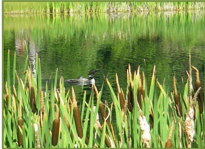
A loon on Abbot Lake.

In 2002, government decided MFR would no longer be responsible for funding the maintenance of Forest Service recreation sites and trails. All Forest Service recreation sites and trails were to be transferred to other agencies and organizations, or closed by March 31, 2004. Partnerships were sought out to continue to deliver the recreation program with user groups or other levels of government. In June 2005, the Ministry of Tourism, Sport and the Arts (MTSA) was created and made responsible for tourism and resort development. In January 2006, MTSA took over responsibility for recreation sites and trails from MFR. MTSA was transferred the responsibility for recreation management under FRPA, along with some, but not all enforcement powers. MFR has retained full enforcement power for forest recreation under FRPA. In 2008, MTSA was reorganized and its name changed to the Ministry of Tourism, Culture and the Arts (MTCA).