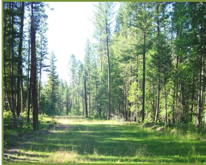
Bull Mountain Ski Trail.

In general, the established recreation trails were maintained in a safe condition with riparian and other resource features protected and were found to be in compliance in all significant respects with the requirements of FRPA and related regulations.