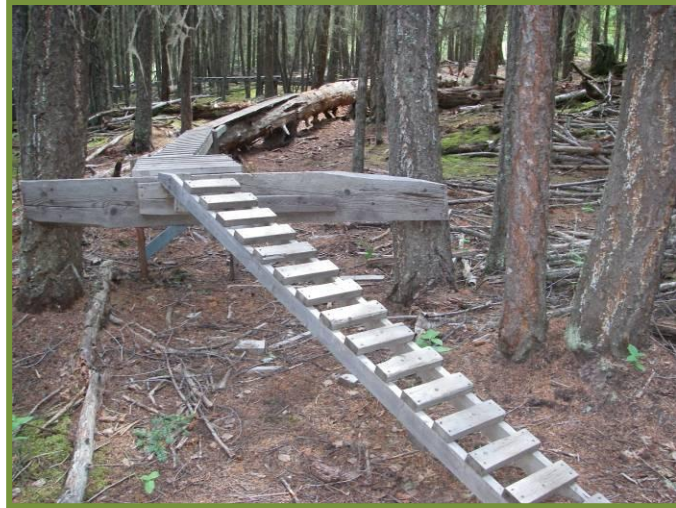
A ladder supported by a board nailed into live trees.

Although the auditors did not observe significant examples of erosion or soil disturbance, likely due to the dry climate, this issue is considered significant due to the vast number of unauthorized trails and the continued risk to public safety. However, in the context of Board audits, the Board can only attribute this issue to the people that built these trails, and since these people are not considered a “party” 5 under FRPA, the Board cannot report this issue as a non-compliance. When these occurrences are discovered and investigated, the people responsible are rarely identified, so enforcement of this requirement is quite difficult.