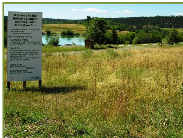
Chimney Lake recreation site.

In general, recreation sites were well maintained with riparian and other resource features protected, and were found to be in compliance in all significant respects with the requirements of FRPA and related regulations.