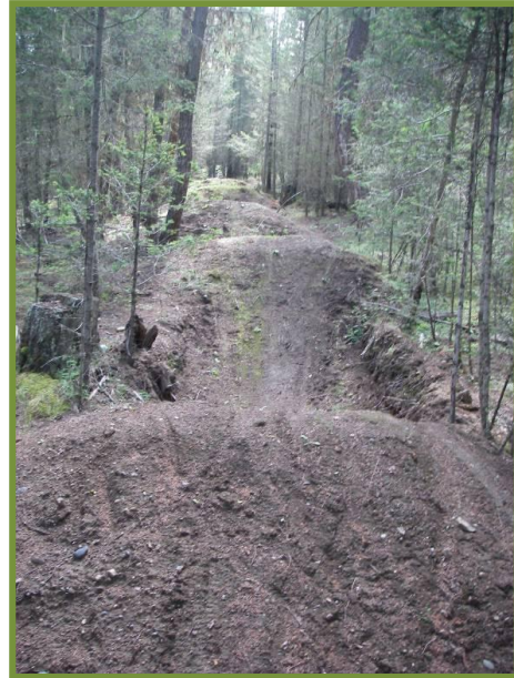
De Sous Mountain Bike Trail.

The audit work on selected sites and trails included both ground-based and some aerial assessments using a helicopter.