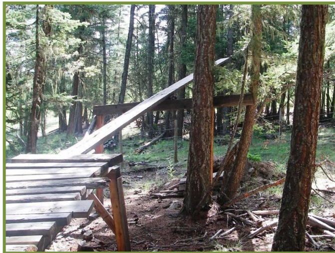
A ramp and teeter-totter technical terrain feature (TTF).

Section 57 of FRPA prohibits the construction, rehabilitation or maintenance of trails or facilities without authorization. Unauthorized trails can result in impacts to the environment, damage to forest resources,