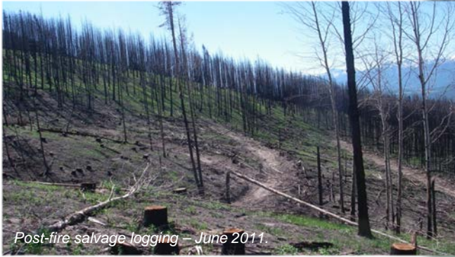
Post-fire salvage logging – June 2011.