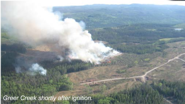
Greer Creek shortly after ignition.