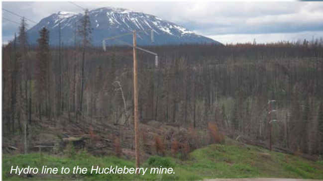
Hydro line to the Huckleberry mine.