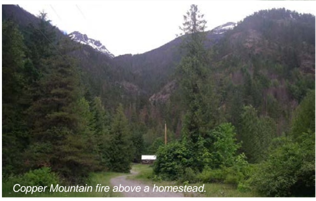
Copper Mountain fire above a homestead.