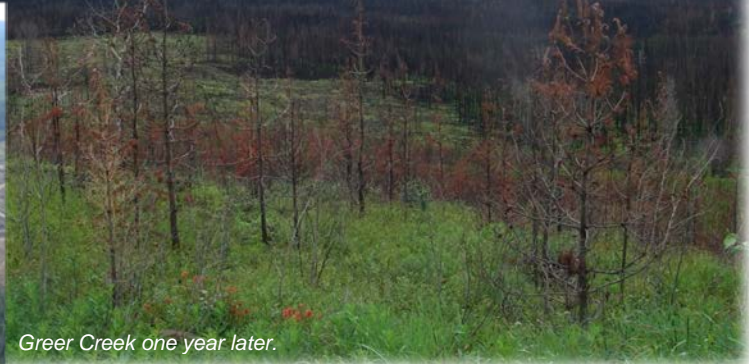
Greer Creek one year later.

The Greer Creek fire began on June 18, 2010, approximately 30 kilometres southwest of Vanderhoof. The Vanderhoof fire management plan classifies the area as “high priority, full suppression.” Values in the area include cabins, lodges, homes, cultural heritage, silvicultural investments and timber.