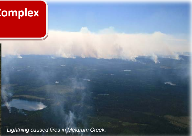
Lightning caused fires in Meldrum Creek.

The Meldrum Creek fire began on July 28, 2010. Initially a five-person crew lead by a forest officer managed the fire. When resources became available a week later, a fire analysis was prepared and the fire was taken over by an incident management team.