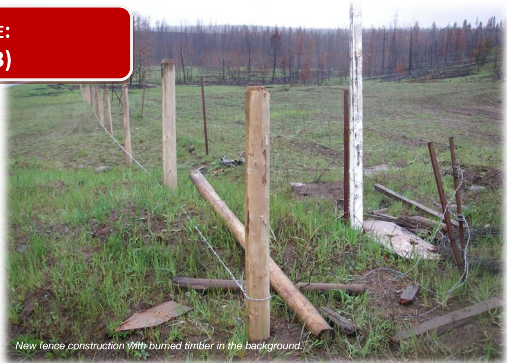
New fence construction with burned timber in the background.

On July 30 th an evacuation order was issued for the Dog Creek reserve.