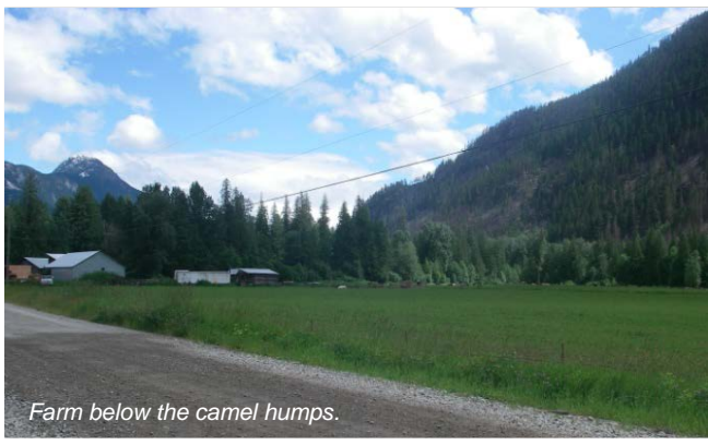
Farm below the camel humps.