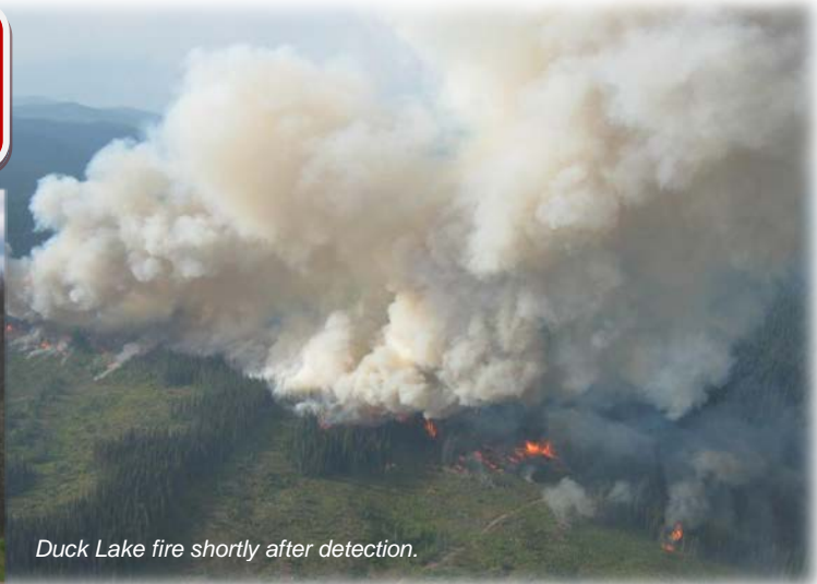
Duck Lake fire shortly after detection.

Duck Lake is located about 43 kilometres south of Houston. Lightning started a fire on a rocky hilltop on July 27, 2010. The fire was not detected until August 1, 2010, due to smoke in the region from numerous other fires. Values potentially affected by the fire included plantations, timber, recreation sites and a transmission line to the Huckleberry mine.