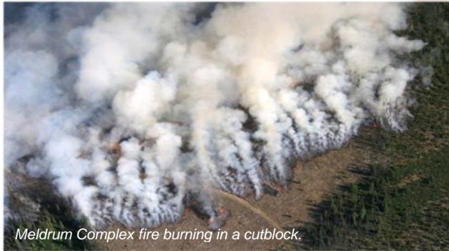
Meldrum Complex fire burning in a cutblock.