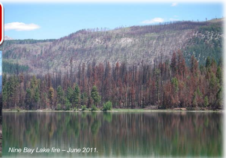
Nine Bay Lake fire – June 2011.

Nine Bay Lake is a popular fishing lake located about seven kilometres west of Harrogate in the Invermere fire zone. The fire started near the lakeshore on August 26, 2010, and it was likely person-caused.