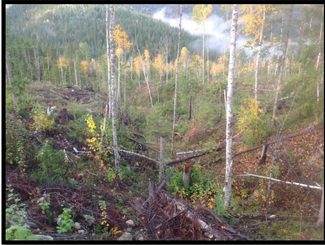
Gullies were well managed.

Auditors found that soil disturbance was minimized and below the limits required by regulation. There were several S6 streams within or adjacent to the cutblocks. The licensee maintained natural drainage patterns, and machine traffic did not disturb the stream banks. The licensee retained wildlife trees in patches and individual stems and met the obligations in the FDP and WLP.