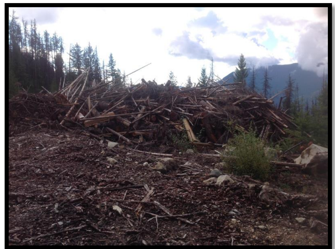
Slash piled to facilitate burning.

No concerns were noted with respect to fire protection activities.