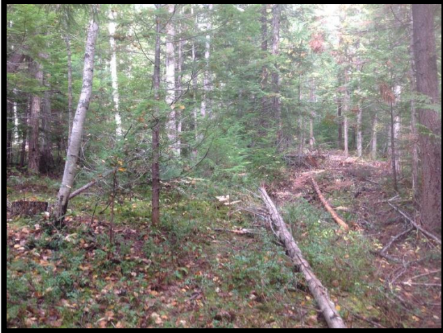
Stand following pre-poling.

numerous streams with and adjacent to the cutblocks. Natural drainage patterns were maintained and machine traffic did not disturb the stream banks. The licensee retained wildlife trees in patches and individual stems and met the obligations in the WLP.