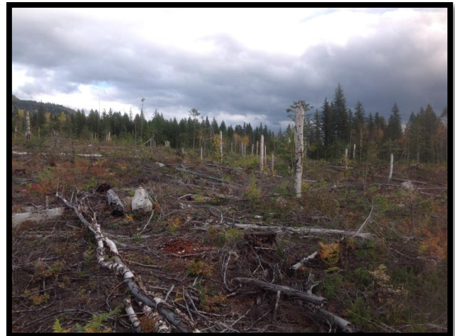
Licensee snapped deciduous stems in an attempt to minimize suckering.

No concerns were noted with respect to fire protection activities.