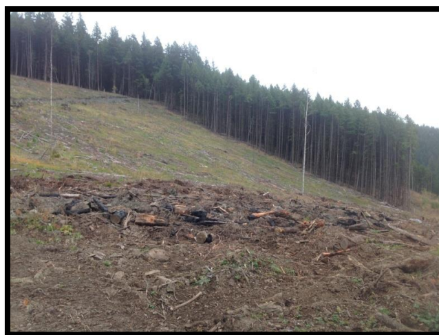
A slash pile that has been burned and site prepared for planting.