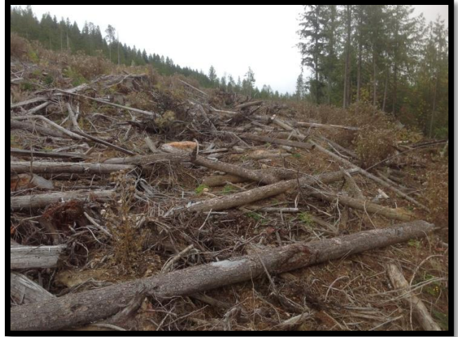
In-block road rehabilitation/ deactivation.

The auditors did not identify any issues with road maintenance or deactivation.