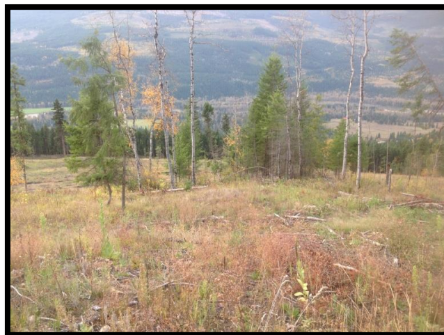
Internal wildlife tree retention.

The licensee complied with the WA. Fire tool inspections were not conducted since there were no active operations. Fire hazard was assessed at the same time as the waste survey and slash was piled and burned on all cutblocks.