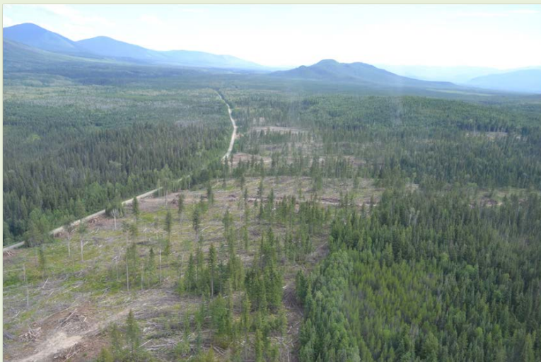
Timber harvesting near Purden Lake in the Prince George District.

Additional information about the Board's compliance audit process is provided in Appendix 1.