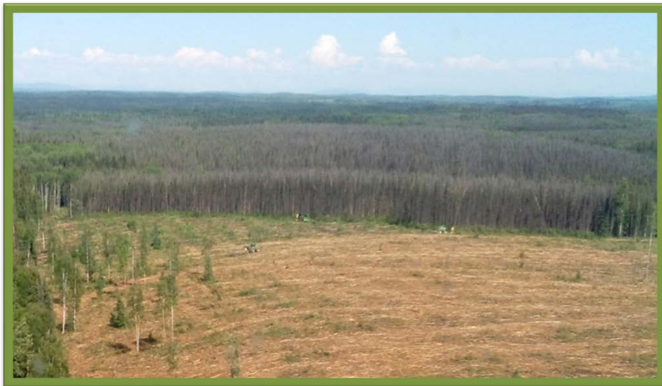
Harvest activity observed during the field inspection.

A TSL holder, SDN Forest Ventures Inc. (SDN), was actively harvesting on TSL A84126 without an adequate fire suppression system, during a period when activities were restricted due to the high risk of starting a forest fire.