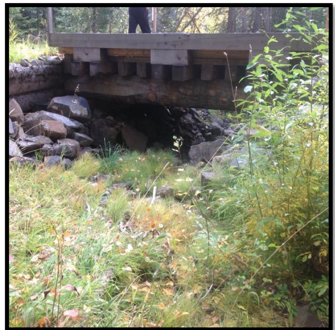
Looking upstream at a bridge crossing on a typical stream in the area.

One forestry professional and a chartered accountant made up the audit team. Fieldwork took place on October 6 and 7, 2014.