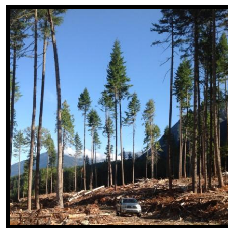
These retained trees will provide future owl habitat

Lil'wat built approximately 15 kilometres of road and was responsible for the maintenance of 102 kilometres of road permit roads and 24 kilometres of forest service road during the audit period. Auditors examined all of the new