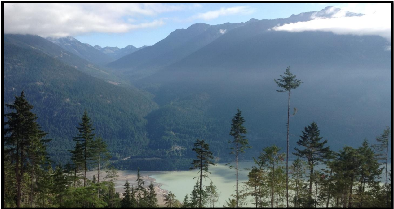
Looking across Lillooet Lake toward Highway 99.

This report explains what the Board audited and the results. Detailed information about the Board's compliance audit process is provided in Appendix 1.