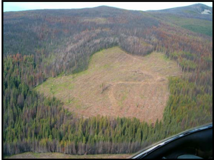
Harvest of trees damaged by the Lamb Creek fire southwest of Cranbrook.

As part of the Forest Practices Board's 2005 compliance audit program, the British Columbia Timber Sales (BCTS) 1 program and timber sale licence holders in the Rocky Mountain Forest District were selected for audit from the population of 12 BCTS business areas in the province. The Rocky Mountain portion of the Kootenay business area was selected randomly and not on the basis of location or past performance. Information on the Board's compliance audit process is provided in Appendix 1 (see page 9).