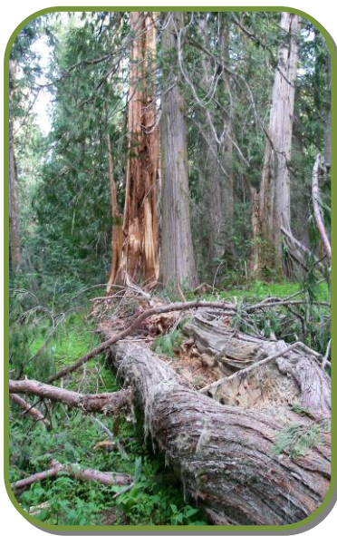
Vetern cedar partially fallen. The rotten core makes determining its age an estimate only.

The Biodiversity Order established landscape biodiversity objectives for old forest retention, old interior forest and young forest patch size distribution. The Biodiversity Order set representation targets for age class by natural disturbance units. In the ICH, old forests are defined as all forests older than 140 years. There is no recognition of different values in much older cedar stands.