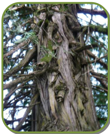
Twisted cedar bark. Thick furrowed bark can provide habitat to a variety of flora and fauna.

Many agencies are engaged in this issue and all have recognized the emerging values in the ICH. The ILMB Legacy Project may result in the spatial identification of OGMAs to conserve rare and representative ecosystem types in the ICH. However, the Ministry of Environment (MOE) also has tools under the FRPA that enable it to provide direction, policy, procedures and guidelines for managing species at risk, which can include plant communities as well as individual species.