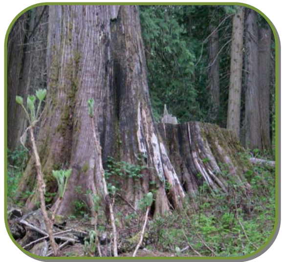
Evidence of logging, fire scarring on cedar trees.

Lichens are an important component of inland rainforests and are a good indicator of biodiversity. For example, epiphytic lichens require humid forest canopies in rarely-disturbed forests, and, because of the unique antique trees of the inland rainforests, many lichen species not found anywhere else in the world thrive there. Inland rain forest old growth stands contain cyanolichens, which will not grow in younger stands. There is still a limited knowledge about the biological communities in these antique forests, but recent studies show a high diversity of lichens.