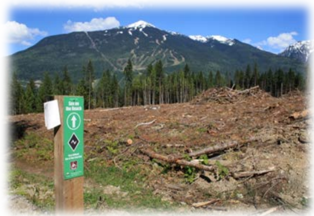
Looking at the ski hill from a recently harvested cutblock in the BFIRP area.

In 2003, a cutting permit was issued within the BFIRP area, and harvesting occurred between 2004 and 2007. As the licensee's planning was still in transition from Code to FRPA requirements, harvest was governed by a forest development plan (FDP) created under the Code, rather than a forest stewardship plan (FSP). Amendments were made to the FDP in 2003 and 2006 respectively, to allow harvesting north of Begbie Creek for bark beetle control and blowdown salvage.