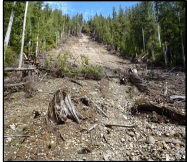
Figure 3. Non-compliant practice: This 4 hectare landslide originated from a road located near the top of the photo. A forest licensee did not sufficiently maintain the road which led to this landslide. The landslide likely had a material adverse effect on source water used for drinking.