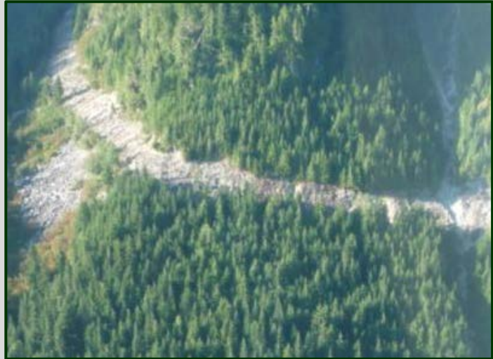
Figure 6. This photo shows a segment of road in watershed #9 that has been permanently deactivated by MFLNRO.

In one of the field-assessed watersheds (#9), the MFLNRO was completing a five-year watershed restoration project. The project involves permanently deactivating about 150 kilometres of non-status roads with the intent of reducing the sedimentation hazard in the watershed over the long-term. The permanent deactivation involves re-contouring the road to the natural slope gradient and removing all culverts and bridges (see Figure 6). Around 4.4 million dollars has been spent completing this project. Monitoring will be required to assess whether the investments will reduce the sediment hazard.