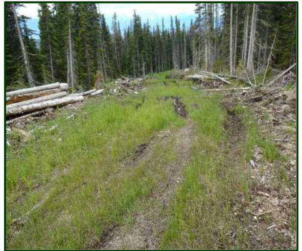
Figure 5. Compliant practice: This road was constructed for winter access to a cutblock. Following harvesting, the road was revegetated, reducing the potential for sediment to be eroded into streams.