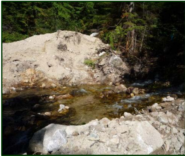
Figure 4. Unsound practice: This figure shows a section of road that was deactivated, including the removal of stream crossing structures. Investigators observed that soil was placed immediately adjacent to the channel. Some of the soil had been eroded into the stream.