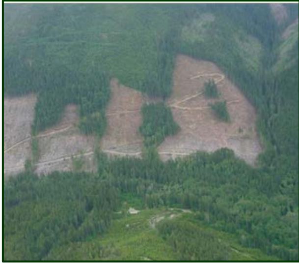
Figure 2. Compliant practice: In this cutblock, trees have been retained along some streams even when there is no requirement to do so.