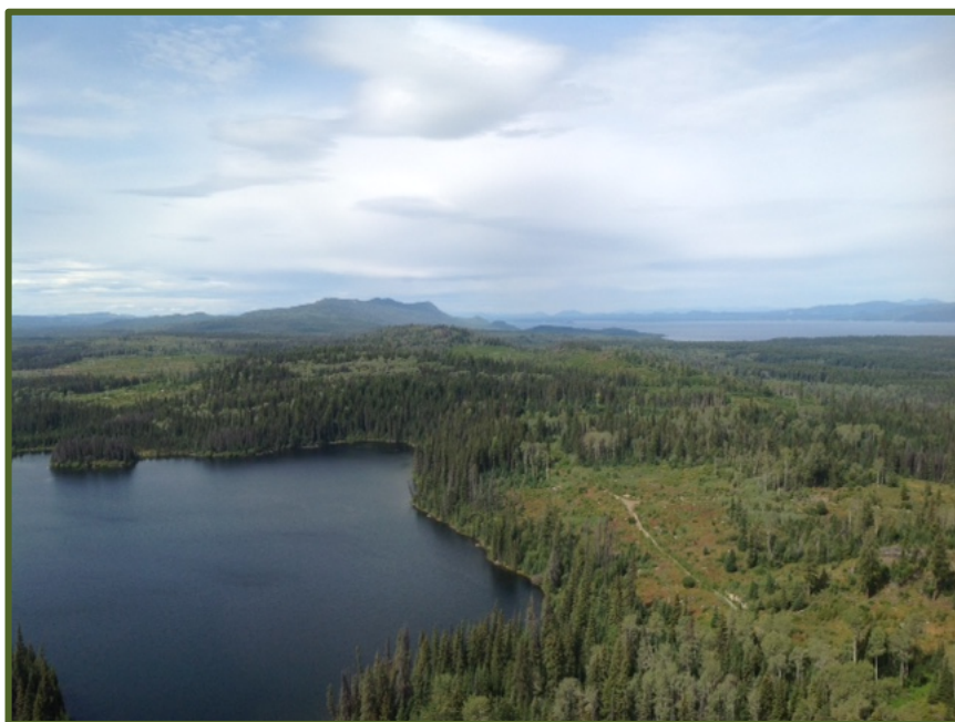
Typical terrain in the Witch Lake operating area.

This report explains what the Board audited and the results. Detailed information about the Board's compliance audit process is provided in Appendix 1 .