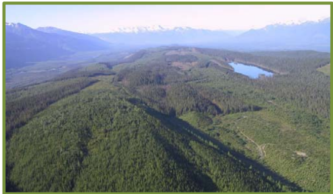
Overview of Nisga'a Lands.

The last of the Board's five audit reports addressing compliance during the transition period was released in May 2007. The final report identified pervasive non-compliance on the licences of New Skeena Forest Products (New Skeena), which did not undertake activities to address its accumulated harvest, silviculture, bridge inspection, road maintenance or road deactivation obligations during the final year of the transition period.