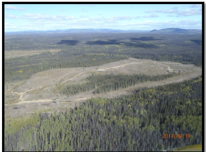
Figure 2 – southeast portion of woodlot 1893.