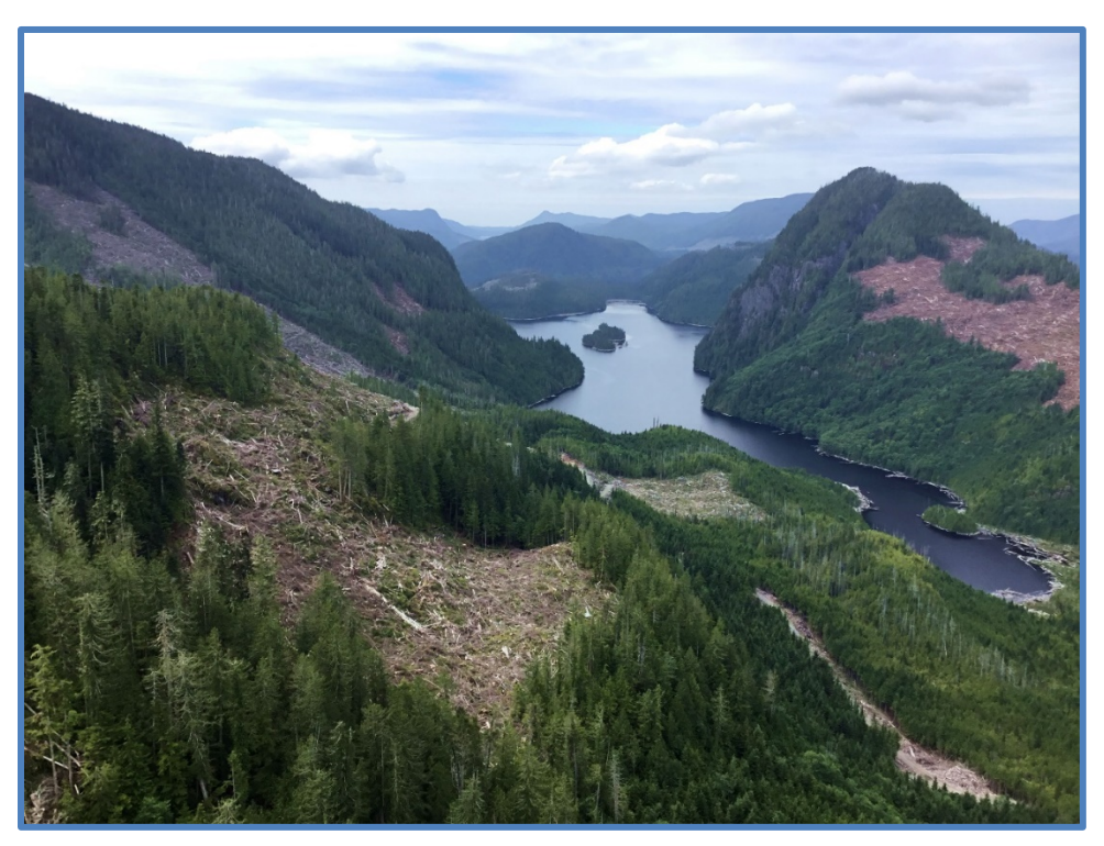
Rugged topography typical of the operating area.

This report explains what the Board audited and the results. Detailed information about the Board's compliance audit process is provided in Appendix 1.