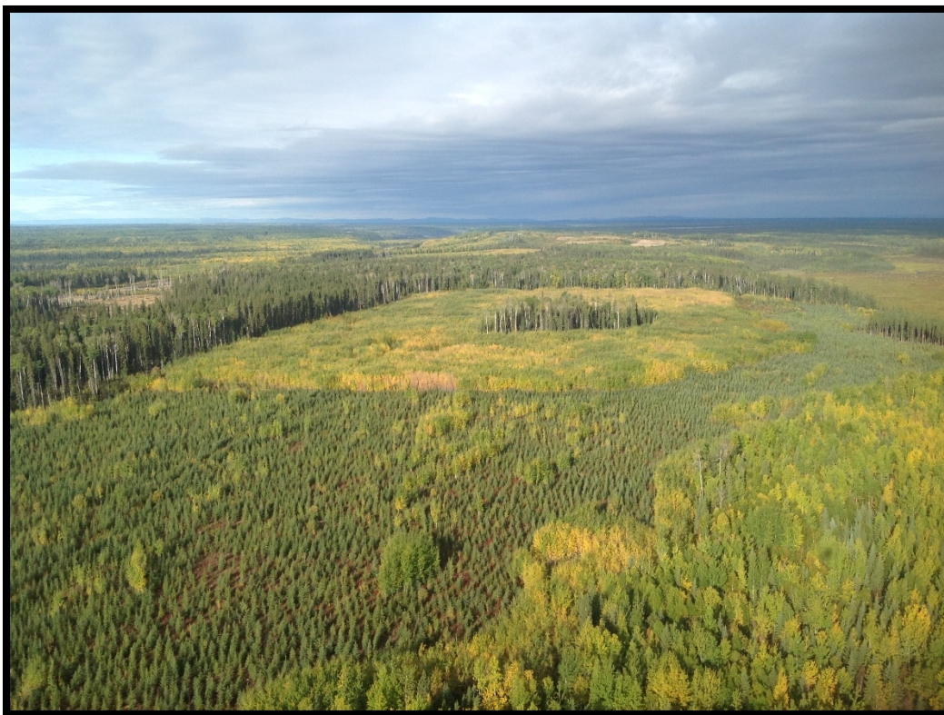
Typical terrain with a regenerated mixed-wood stand.

This report explains what the Board audited and the results. Detailed information about the Board's compliance audit process is provided in Appendix 1.