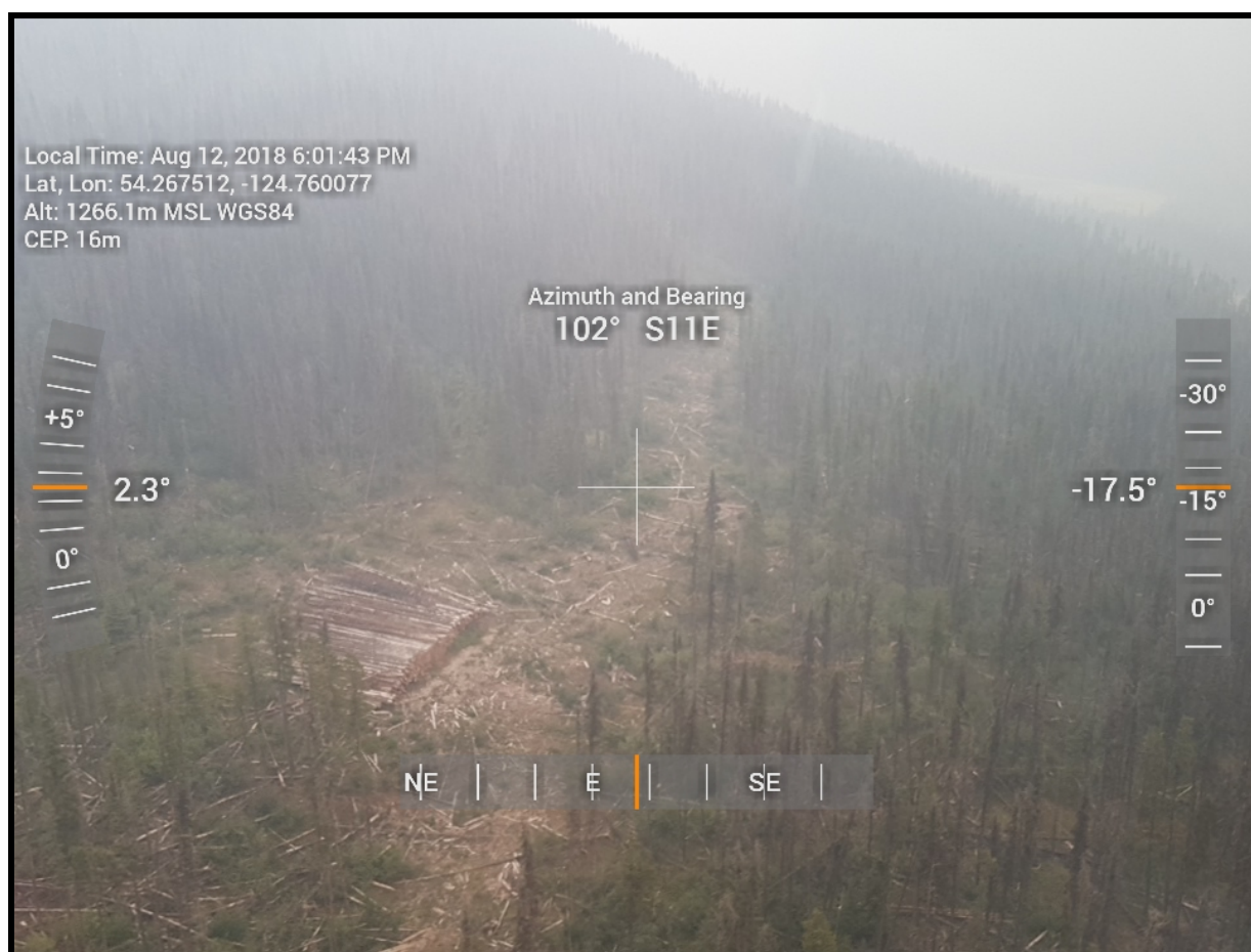
Photo 1. Timber Sale Licence A91995 showing decked logs and a trail. Logging of this block was not complete at the time of the wildfire.

The complainant asked that industry and the public be informed of the issue, and the problems that it creates in firefighting, to ensure it does not continue to happen. He also requested that any existing debris piles or decks be dealt with in a timely manner, and that forest professionals and licensees be responsible and accountable for their actions and decisions.