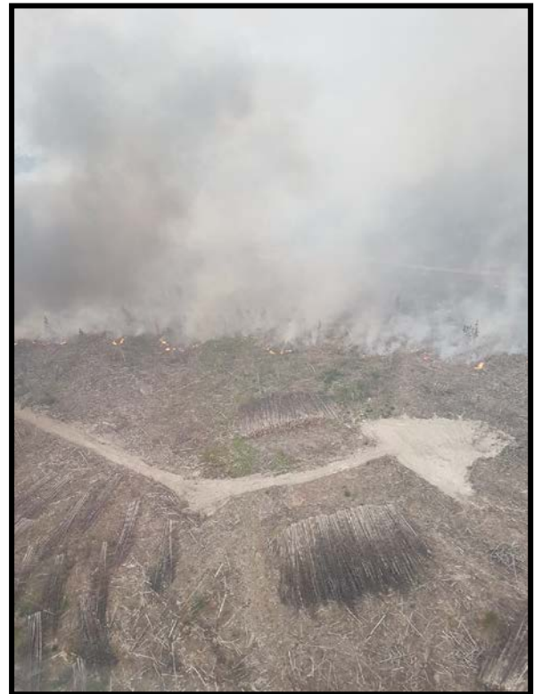
Photo 2. Timber Sale Licence A91995. This photo shows the approaching fire, bunched timber (bottom left) and timber awaiting processing on both sides of the road.

Photo 4 (p. 4) shows a pine stand 13-20 years after beetle attack when the trees start to rot at the base and fall over. The report notes that "Fires, occurring during drought periods in heavy concentrations of downed woody fuels, produce extreme fire intensities, are damaging to sensitive sites, and are impossible to control."