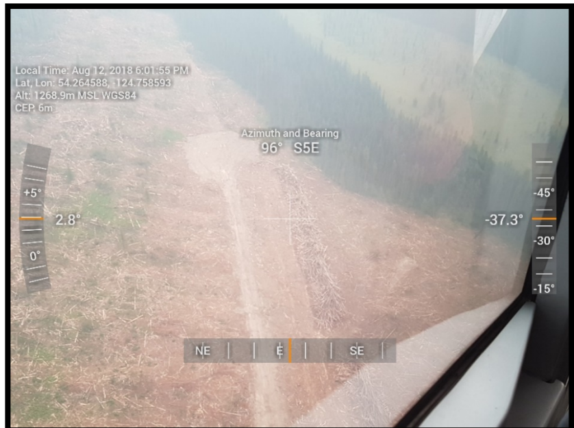
Photo 3. Timber Sale Licence A91996. This photo shows a windrow of debris parallel to the road. This block was logged between October 2017 and April 2018.