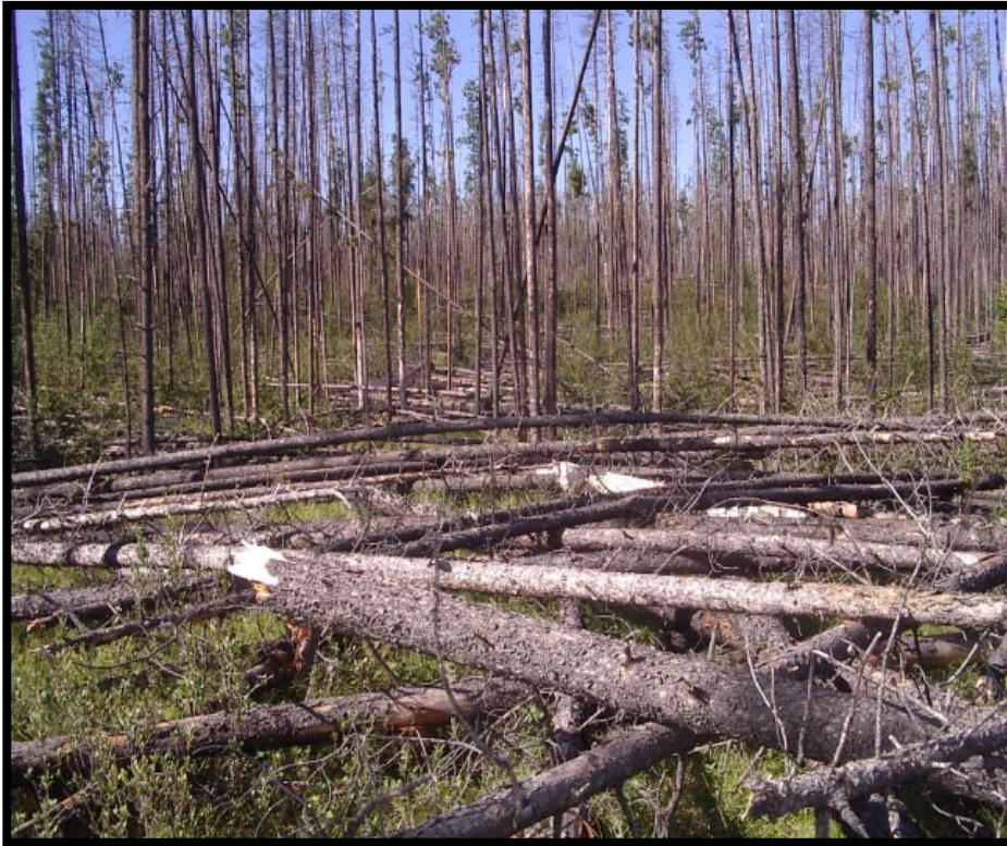
Photo 4. A pine stand 13 – 20 years after attack by the mountain pine beetle.

Industrial activities, such as harvesting, can change the amount and arrangement of fuel on the landscape and can create, reduce or increase a fire hazard. The Wildfire Act requires a person who carries out an industrial activity on forest land to conduct fire hazard assessments. If an assessment identifies that the activity has created a fire hazard, the person must abate it. The Wildfire Regulation specifies when fire hazard must be assessed, what the assessment must include, and when a hazard must be abated. While a licensee must abate a hazard it has created, it is not required to abate a naturally occurring hazard such as beetle-killed timber.