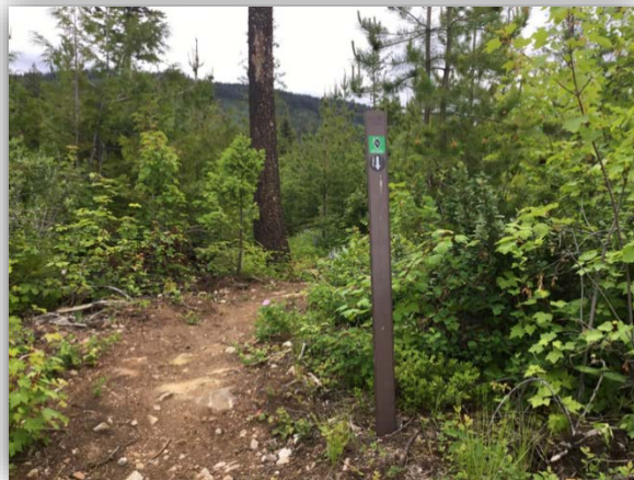
BCTS accommodated recreation trails in a free-growing cutblock in the Candle Creek trail network, north of Clearwater.

BCTS is meeting its current regeneration, free-growing and annual reporting requirements. Auditors had no concerns with silviculture planning or practices.