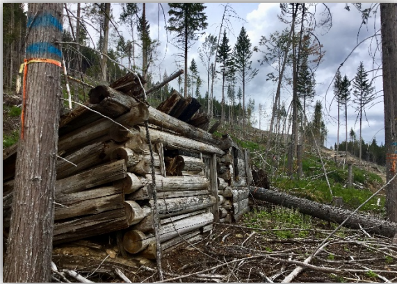
An old trapper's cabin marked by BCTS during layout and preserved during TSL harvest activities.