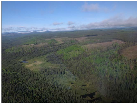
Dawson Creek TSA.

The Forest Practices Board is the public's watchdog for sound forest and range practices in British Columbia. One of the Board's roles is to audit the practices of the forest industry to ensure compliance with the Forest and Range Practices Act (FRPA) and the Wildfire Act .