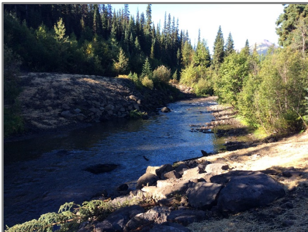
Wolverine Creek after structure removed