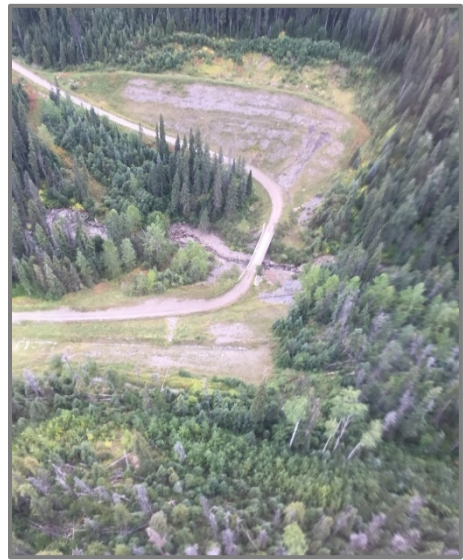
Fisher FSR – example of a well maintained road and bridge.

Structure removal was well done and there was no evidence of sediment delivery to the streams. Deactivated road sections draining into the crossing were grass seeded after structure removal.