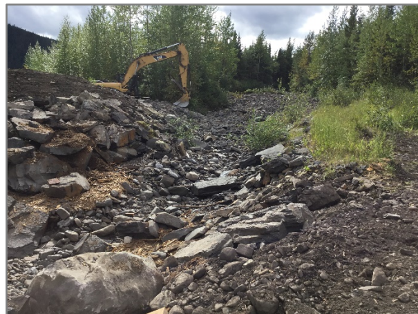
Active structure removal on a tributary to Wolverine Creek

Auditors did not identify any issues with road deactivation or structure removal and the deactivation plan was being carried out as designed.