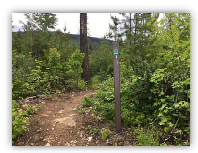
BCTS accommodated recreation trails in a freegrowing cutblock in the Candle Creek trail network, north of Clearwater.

BCTS is meeting its current regeneration, freegrowing and annual reporting requirements. Auditors had no concerns with silviculture planning or practices.