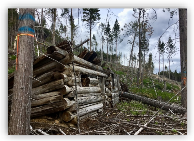
An old trapper's cabin marked by BCTS during layout and preserved during TSL harvest activities.