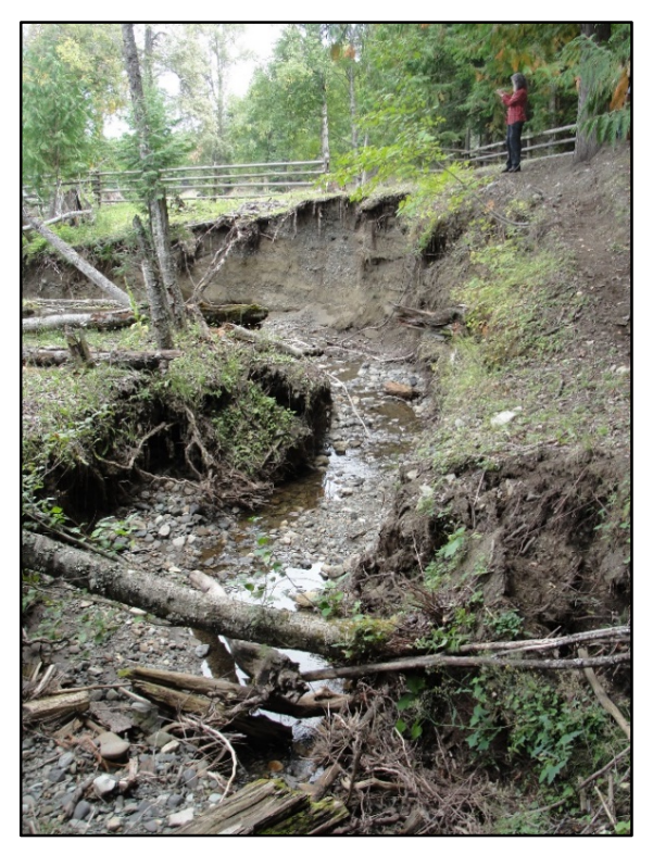
Figure 3. Evidence of stream bank erosion was observed on most sections of Bonneau Creek that flow through the complainant's private land.