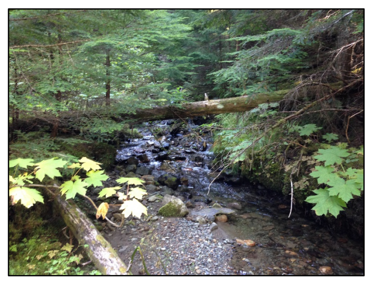
Figure 2. Several sections of Bonneau Creek on Crown land were traversed, just upstream of the complainant's private land. No indicators of channel disturbance were observed. The channel width at this point is about 2.5 metres.

Following the field examination, the FLNR hydrologist conducted a GIS (or geographic information system) analysis of the watershed as a whole and its three subbasins (see map of the Bonneau Creek watershed and sub-basins in Appendix 1). As part of the analysis, the