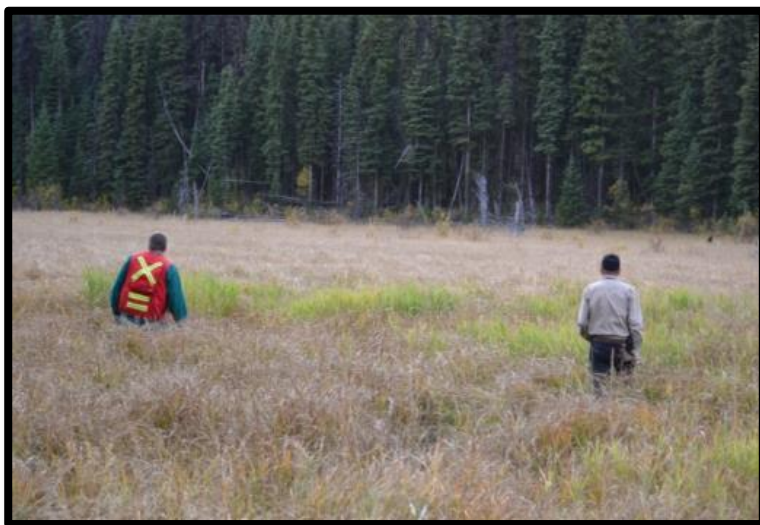
Figure 5. This photo shows the 4-hectare hay field, which has not been cut in several years.

There was no indication of recent hay cutting and no issues were identified.