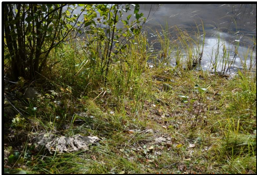
Figure 4. This photo shows evidence of light livestock use in a riparian area adjacent to a fish-bearing lake on tenure RAN076681.

All range developments were functional and maintained. There was no evidence of livestock use within or immediately adjacent to Donnelly Lake Provincial Park.