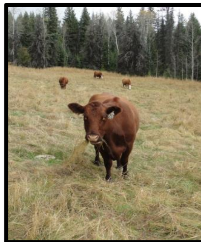
Figure 1. Cattle grazing in a pasture.

On the Lily Lake unit, Pincott Ranches Ltd. employs a rotational grazing strategy centred on three, mostly fenced, pastures. This strategy also alternates on odd and even years, and provides an opportunity for grasses to recover after grazing.