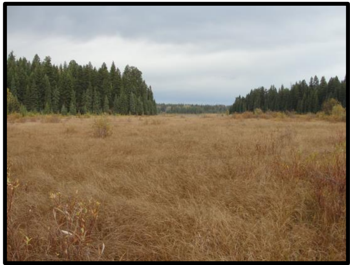
Figure 2. For RAN073562 and RAN074611, auditors found little evidence of cattle use in sensitive riparian areas, including this large wetland.

Auditors found that Pincott Ranches Ltd. complied with all applicable range practice requirements. Protection of water quality, licensed waterworks, riparian areas (see Figure 2), fish habitat and upland areas was achieved. All range developments were functional and maintained (see Figure 3).