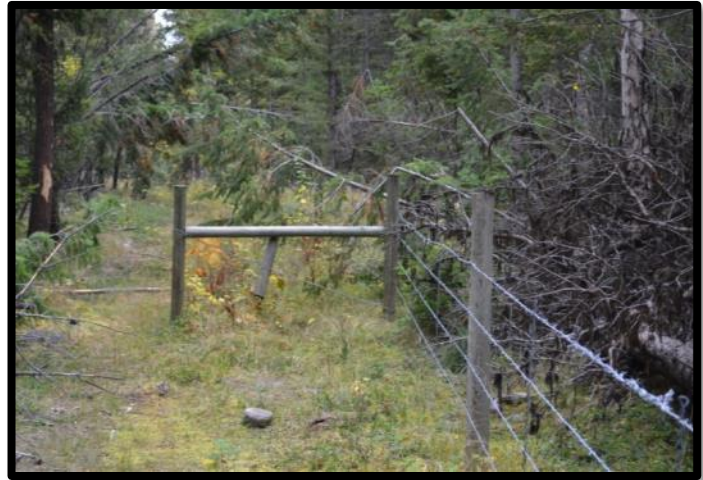
Figure 3. Each of the three grazing tenures audited had fences that have to be maintained by the range user. Despite the high number of mountain pine beetle affected trees that fall onto the fences, all fences were functional and well maintained.

Auditors found that Pincott Ranches Ltd. met the requirements in its plan, including the grazing schedule, minimum stubble heights, maximum browse utilization and salt placement away from riparian areas. All practice requirements related to protection of water quality, licensed waterworks, riparian areas (see Figure 2), fish habitat and upland areas were achieved. Range developments were functional and well maintained (see Figure 3).