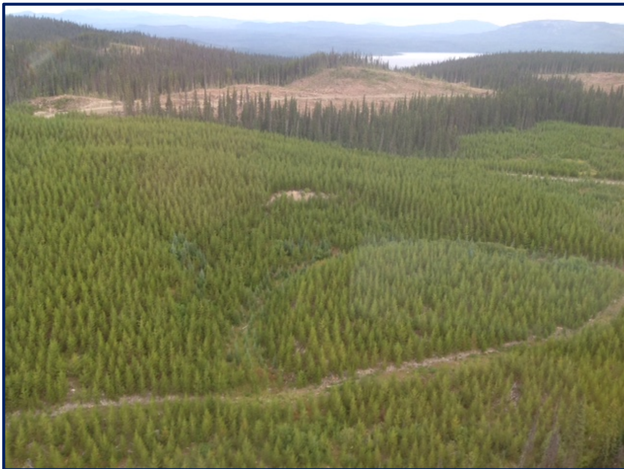
Rolling terrain typical of audit area.

This report explains what the Board audited and the results. Detailed information about the Board's compliance audit process is provided in Appendix 1.