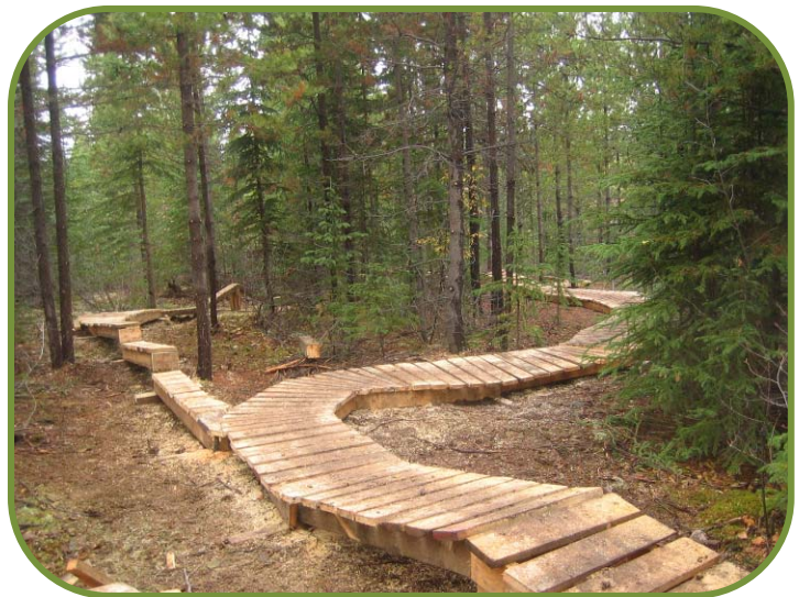
Example of a mountain bike trail.

The Board's audit fieldwork took place from October 15 to 18, 2007.