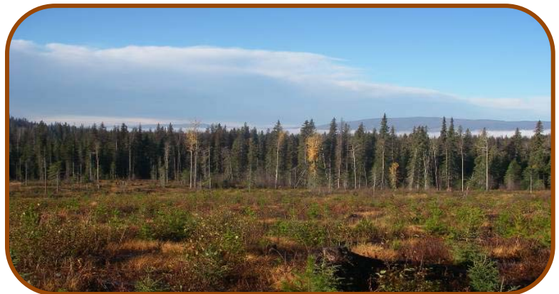
Sufficiently restocked cutblock.

The community forest is within the area covered by the Lakes District Land and Resource Management Plan (Lakes LRMP). Parts of the LRMP were declared a higher level plan, iv requiring operational plans to be consistent with those parts of the Lakes LRMP. Other portions of the LRMP provide broad operational guidance for forest practices in the plan area.