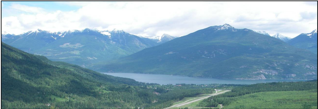
Figure 1. Overlooking Kaslo and the north arm of Kootenay Lake.

As part of its 2008 compliance audit program, the Forest Practices Board randomly selected the Kootenay Lake Forest District as the location for a full scope compliance audit, with a focus on community tenures. Within the district, the Board selected the Harrop-Procter Community Forest and the Kaslo and District Community Forest Society for audit (see map on page 2). Information about the Board's compliance audit process is provided in Appendix 1.