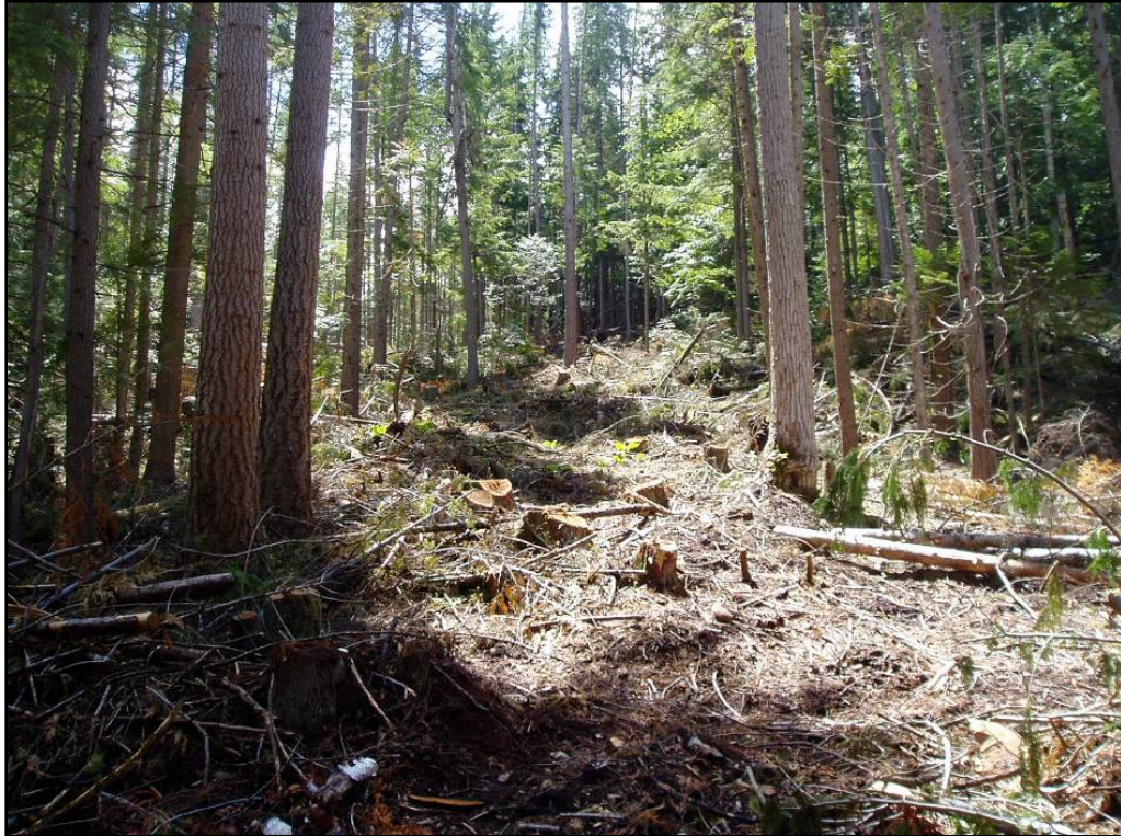
Figure 2. Shelterwood silvicultural system near Narrows Creek in the Harrop-Procter Community Forest.

Harrop-Procter harvested 158.6 hectares in five cutblocks and Kaslo harvested 38.1 hectares in three cutblocks, during the audit period. The Board audited all of these cutblocks.