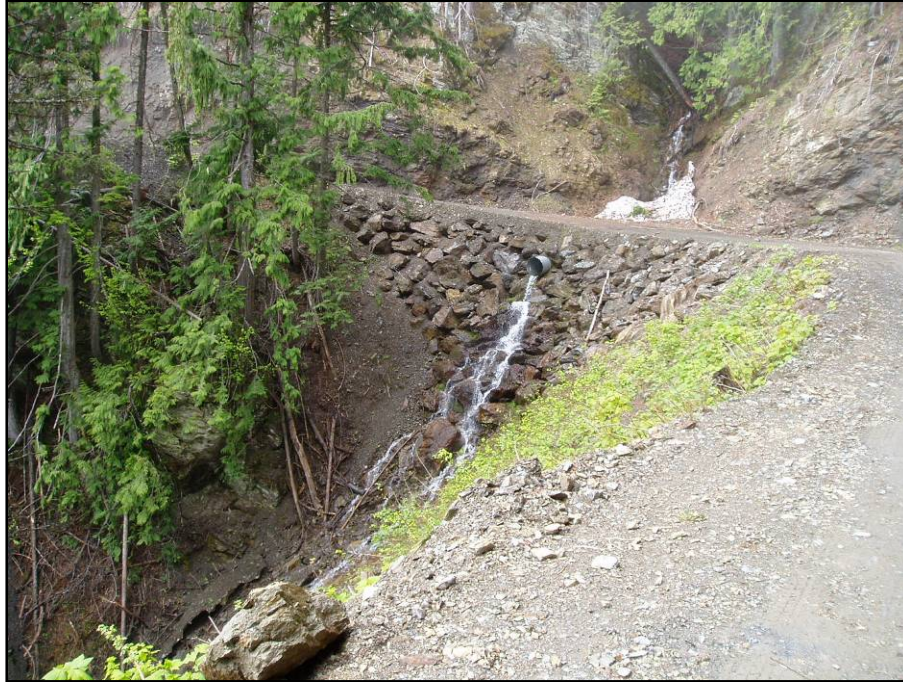
Figure 3. Milford forest service road at Kemball Creek, Kaslo.