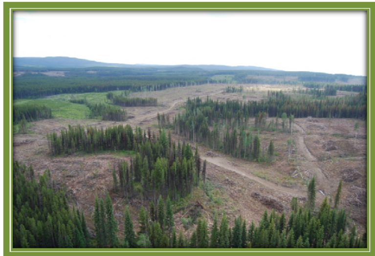
A typical cutblock near Merritt.

Additional information about the Board's compliance audit process is provided in Appendix 1.