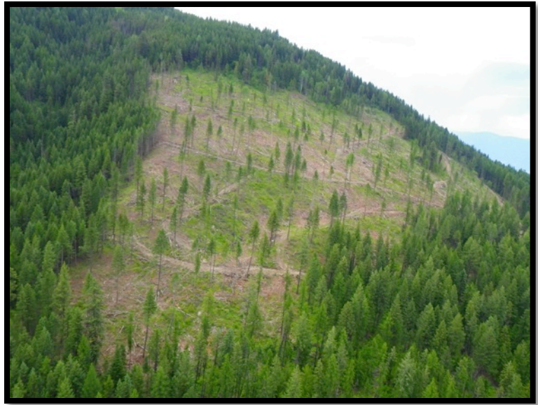
Scattered trees retained in a harvested block near Dodge Creek