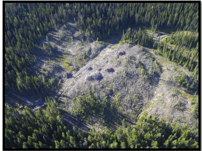
Figure 1 – small cut block on Woodlot 1888.

Woodlot licence W1881 was awarded in 2009, and has a total area of 1383 hectares, of which 1163 hectares is Crown land and 220 hectares is private land. The private portion had no activities or obligations subject to audit. The Crown portion is also located north of Fort St. James adjacent to Mount Pope Provincial Park and W1431. The licence had an initial AAC of 2 733 cubic metres per year. In 2010, the district manager awarded a cut uplift of 20 000 cubic metres. During the two-year audit period, the holder of woodlot licence W1881 harvested about 32 000 cubic metres of timber.