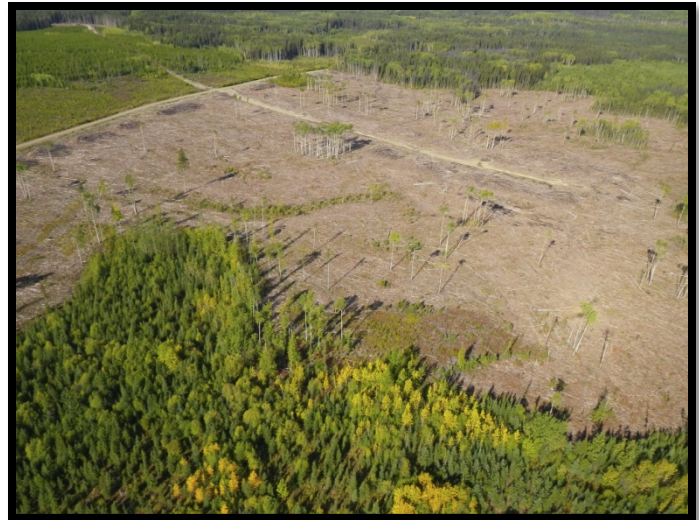
Figure 1 – Aspen retention on Woodlot 1431.

Woodlot licence W1431 was awarded in 2010, and has a total area of 1104 hectares, of which 980 hectares is Crown land and 124 hectares is private land. The private portion had no activities or obligations subject to audit. The Crown portion is located north of Fort St. James adjacent to Mount Pope Provincial Park. The licence had an initial AAC of 2 250 cubic metres per year. In 2010, the district manager awarded a cut uplift of 40 000 cubic metres. During the two-year audit period, i the holder of woodlot licence W1431 harvested about 104 000 cubic metres of timber.