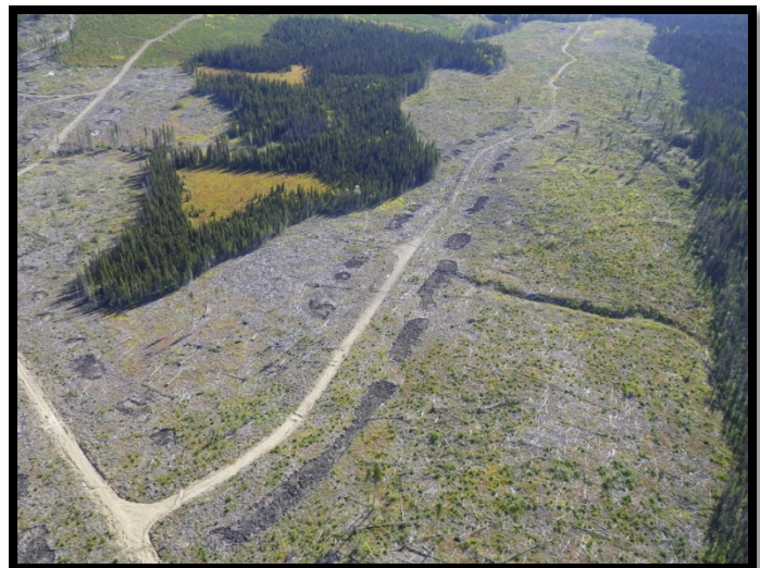
Figure 2 – slash burned and wetlands protected on Woodlot 1881.