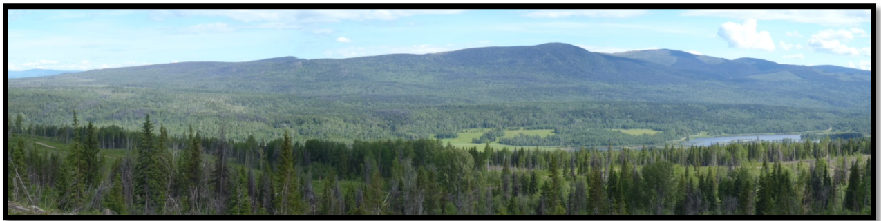
Rolling terrain east of Horsefly.

Additional information about the Board's compliance audit process is provided in Appendix 1.