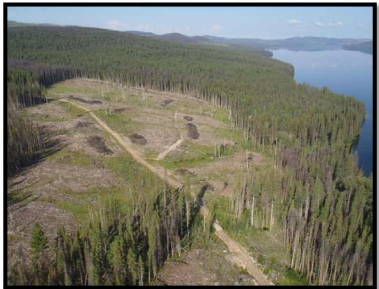
A cutblock on the south shore of Bonaparte Lake, shows typical forest practices in the licence.

Additional information about the Board's compliance audit process is provided in Appendix 1.