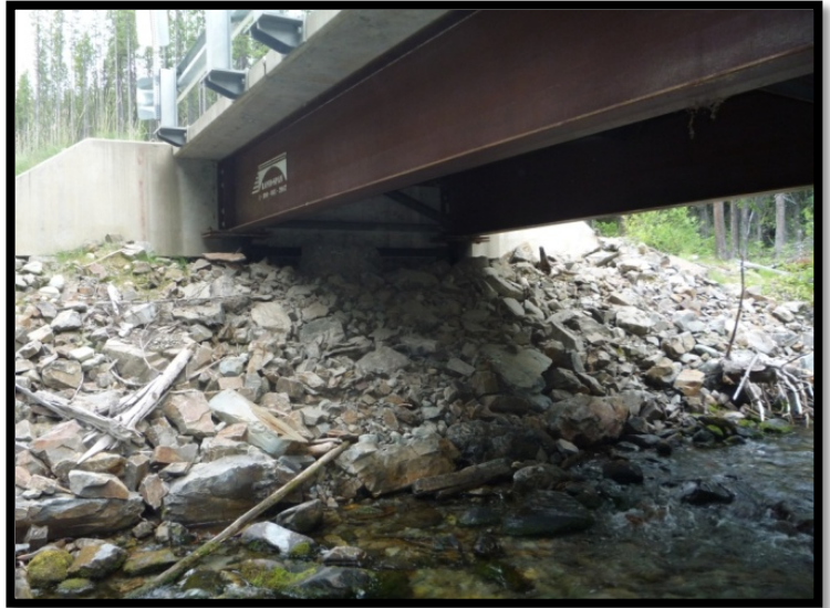
Stream crossing in the Mark Creek Community Watershed.

Overall, the management of operations within MCCW was well done.