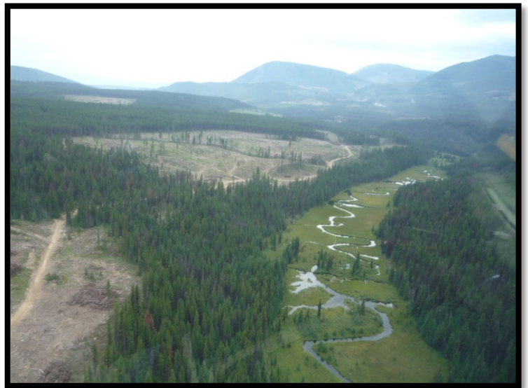
Riparian feature managed with forested buffer.

New bridge construction was managed extremely well. Qualified registered professionals supervised the installation and certified the bridge once it was installed.