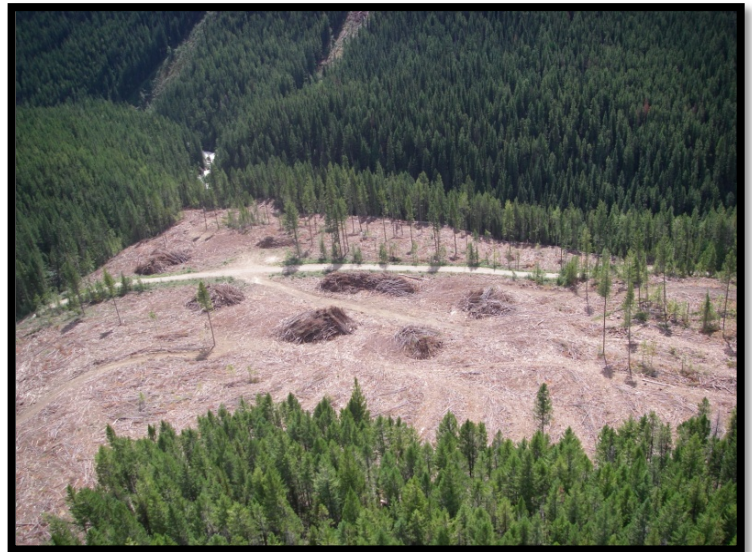
Debris piled to facilitate disposal.

BCTS developed an Emergency Response Plan (ERP) template for TSL holders to complete and forward to the Southeast Fire Centre. The ERP contains relevant information such as contact details and location of operations. BCTS only confirms that the TSL holder completed a fire hazard assessment on high risk sites. BCTS ensures debris piles are disposed of on all sites by inserting a mandatory debris disposal clause in the TSL Licence document. TSL deposits are not fully returned until debris disposal has been confirmed.