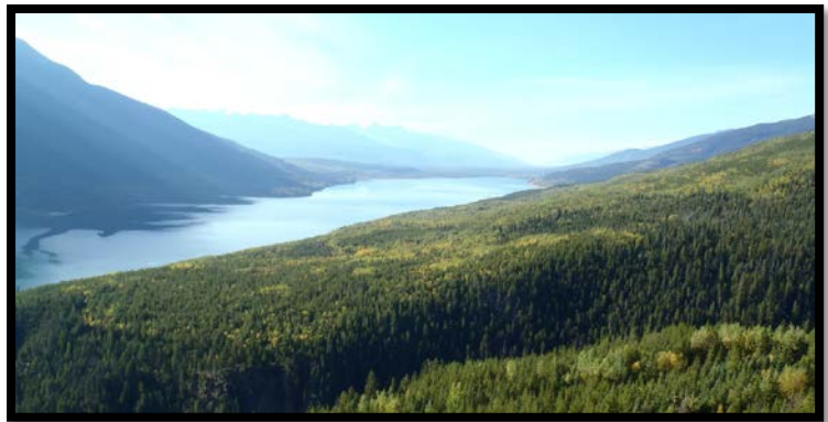
Overlooking the Canoe Reach of Kinbasket Lake towards Valemount.

Additional information about the Board's compliance audit process is provided in Appendix 1.