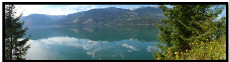
View of Stella-Jones' operations on the northeast arm of Upper Arrow Lake, near the community of Beaton.

Additional information about the Board's compliance audit process is provided in Appendix 1.