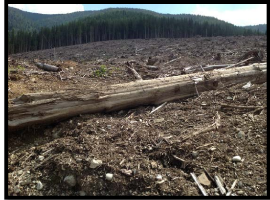
Rehabilitation of a bladed skid trail.

Harvesting practices were consistent with site level plans. Soil disturbance was well managed and within FRPA limits and natural drainage patterns were maintained. Wildlife tree patches were reserved as planned and were situated to protect resources such as streams and trails. Bladed skid trails were rehabilitated well, leaving little evidence that the structures previously existed. Also, cutblocks were well designed to reduce visual impacts in scenic areas.