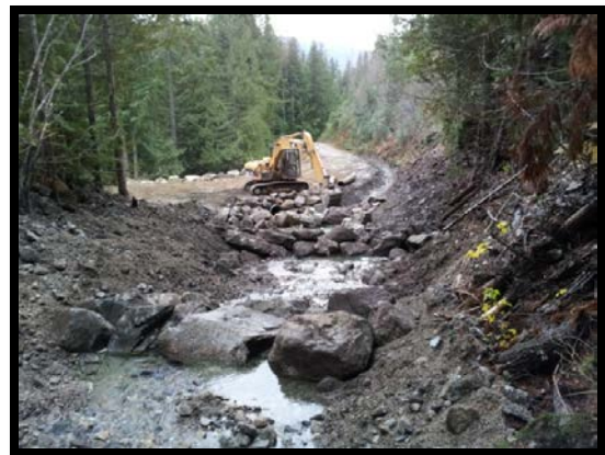
Drainage restoration of a washout on Caribou FSR.

Stella-Jones demonstrated that it has a process in place to track the roads and drainage structures that it is responsible for and to ensure that the maintenance obligations on these roads and structures are met.