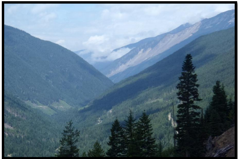
The Sumallo River valley with the Hope Slide in the background.

Additional information about the Board's compliance audit process is provided in Appendix 1.