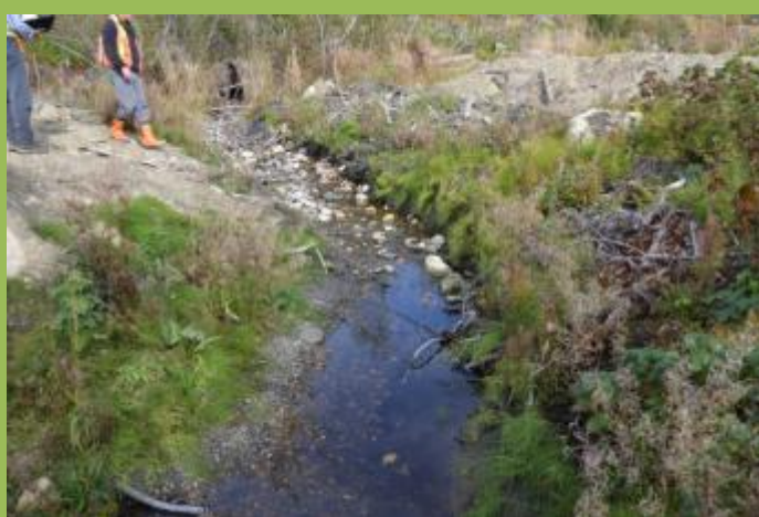
Road deactivation maintaining natural drainage patterns.

Three forestry professionals and a chartered accountant made up the audit team. The Board's audit field work took place from September 23 to 27, 2013. Additional information about the Board's compliance audit process is provided in Appendix 1.