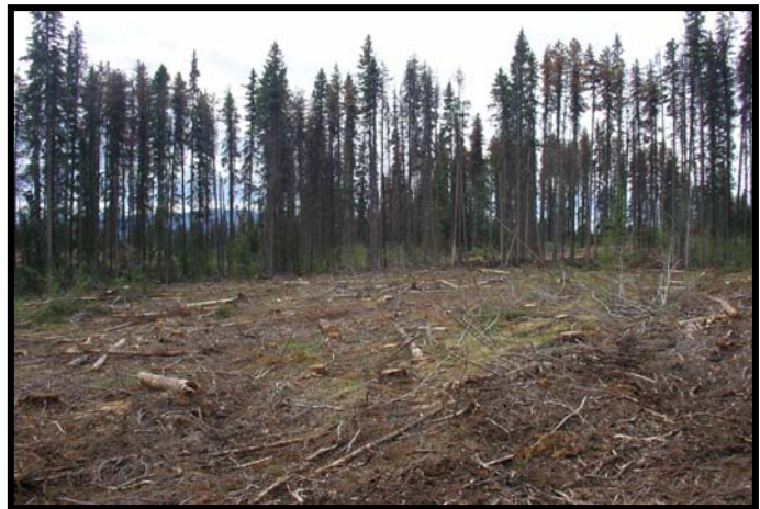
Timbered buffer left standing in one of the small openings.

In March 2004, the Burns Lake Indian Band entered into a forest and range agreement with the province, which provided the Band access to an additional 50,000 cubic metres over a two-year period.