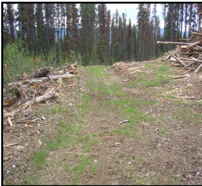
Existing trail that has been rehabilitated – note grass seeding.

This additional volume, combined with the direct award volume, provided access to 125,000 cubic metres of timber over a five-year period. The focus of the harvest is mountain pine beetle-damaged timber within the Lakes Timber Supply Area.