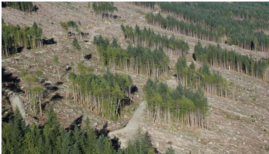
Close-up of Interfor harvest block showing retention in patches, clumps, and single tree configurations.