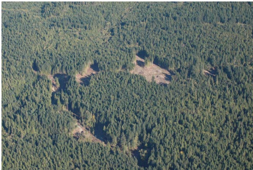
Aerial overview of Northwest harvested openings where focus is on the deciduous component of the forested landbase.