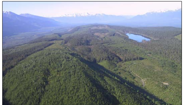
Figure 1: Overview of Nisga'a Lands

The transition period ended on May 10, 2005. This is the last of five compliance audit reports relating to forestry operations and obligations under Crown tenures on the Nisga'a lands during that period.