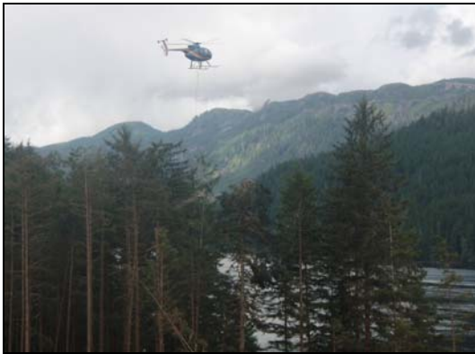
Retained trees being topped to improve their ability to withstand the toppling forces of the wind.

The TFL is on the northwestern portion of Vancouver Island. The TFL 6 operating area is exposed to strong fall and winter winds from the Pacific Ocean. Although the harvesting practices comply with legislation, the audit did identify that windthrow is occurring on the land base.