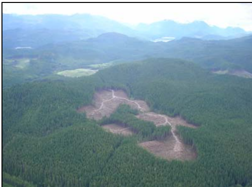
Harvest design is used in conjunction with on-ground treatments to minimize impacts of windthrow. The large retention area in the middle of this block was kept in order to reduce "fetch distance" to the edge of the harvest block, which is adjacent to a provincial park.

risk management, which also contain effectiveness monitoring clauses and protocols. Implementation of these strategies demonstrates WFP's commitment to adaptive management, emphasized by its inclusion of, and therefore legal commitment to, the S3 stream strategy in its approved forest stewardship plan.