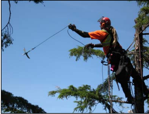
A close-up photo of manual tree topping. Note how the worker uses a grapple to swing to the next tree rather than climbing down and back up.

The document is a result of extensive monitoring of edge treatments, and review of WFP's previous procedure. In conjunction with this strategy, WFP has also developed innovative trial strategies for windthrow management near S3 ix streams and for terrain