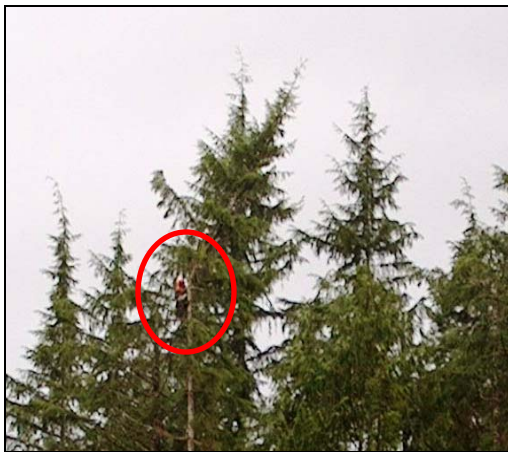
A distant photo of manual tree topping. Photo courtesy of Western Forest Products Inc.

Photo courtesy of Western Forest Products Inc.