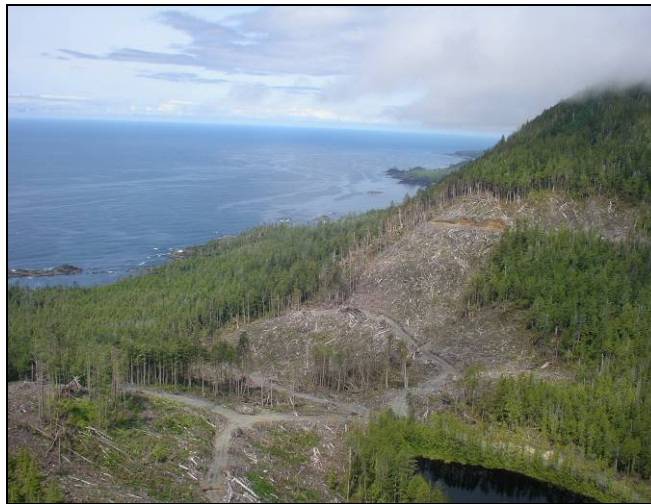
The tree farm licence area is exposed to the open Pacific Ocean.

The TFL covers 198,113 hectares of land on the northern portion of Vancouver Island within the North Island-Central Coast Forest District, which is based in Port McNeill. Principal communities within or near the TFL include Port Hardy, Port McNeill and Port Alice. Smaller communities within the TFL are Holberg, Winter Harbor, Quatsino and Coal Harbor. The Quatsino, Kwakiutl and Tlatiasikwala First Nations traditional territories cover much of the TFL 6 landbase.