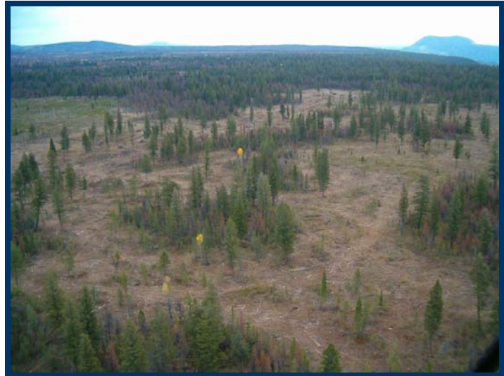
Sigurdson cutblock east of Alexis Creek.

Under NRFL A73558, the provincial government committed 150,000 cubic metres per year of timber to Sigurdson for the purpose of harvesting stands infected by mountain pine beetle.